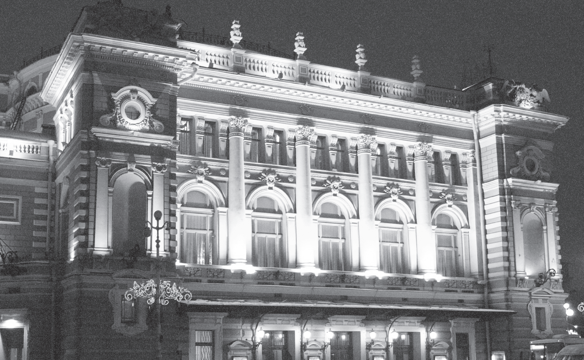
Mariinsky Theatre, St. Petersburg